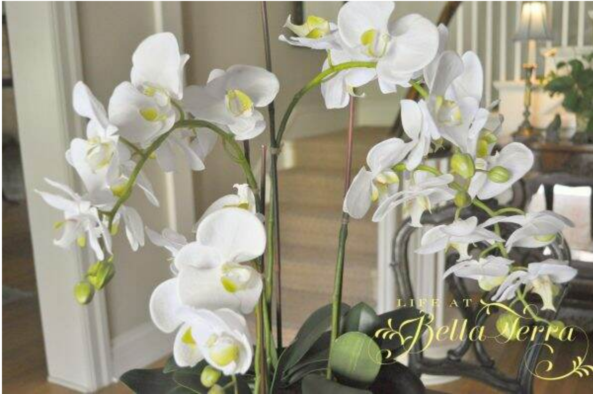
table is a grouping of artificial orchids~~white ones that strongly contrast the dark wood table. They certainly aren't as detailed as the real orchids, but they look authentic from a distance.

And I don't forget to tend to these orchids, as they look great every day!