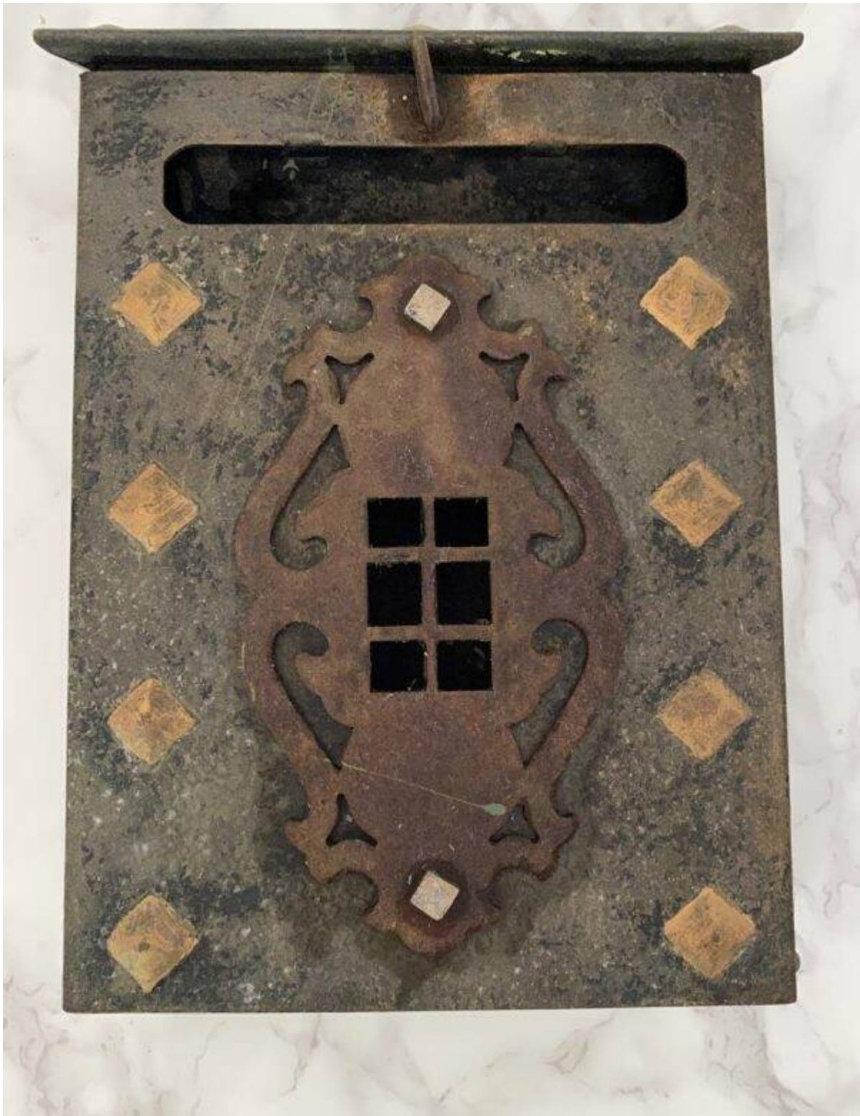
The mailbox after....