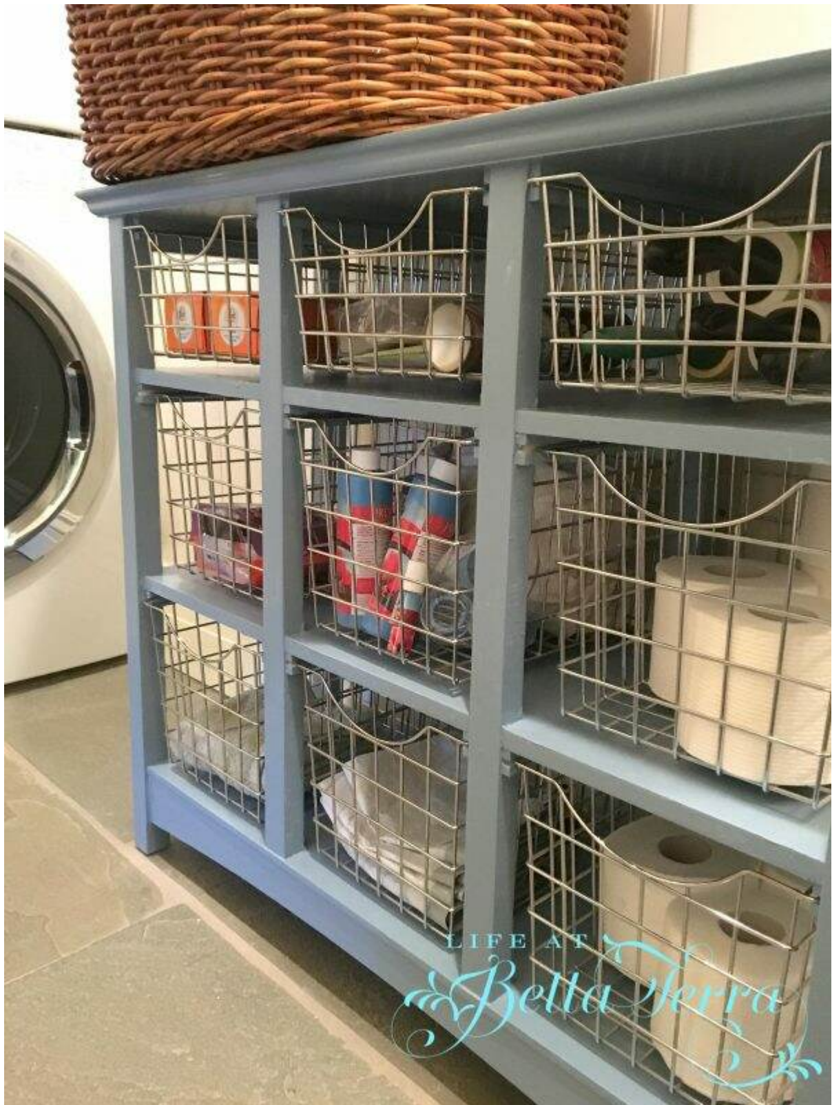
Here's a view up to the laundry shoot.