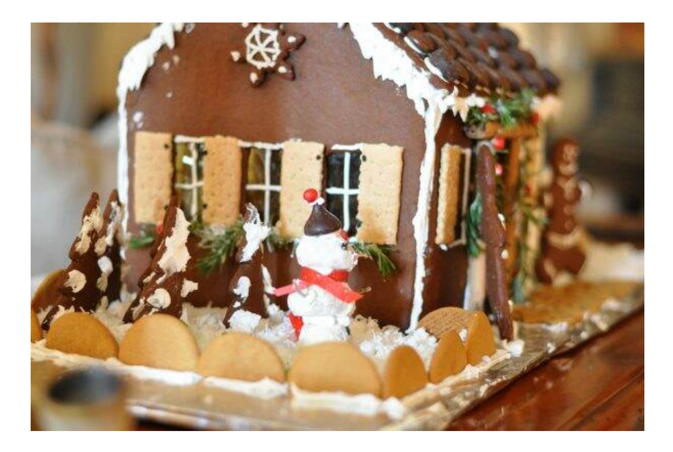
He even has a carrot for a nose!