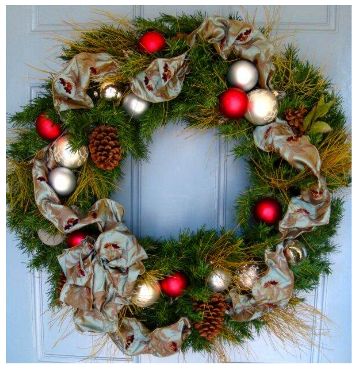
My front door wreath in 2009

Even though I don't feel like I've completed everything for this holiday, I have an odd sense of calm about it. The magic of Christmas happens regardless. Today, I am just enjoying the rainy day and the blessings the season brings.