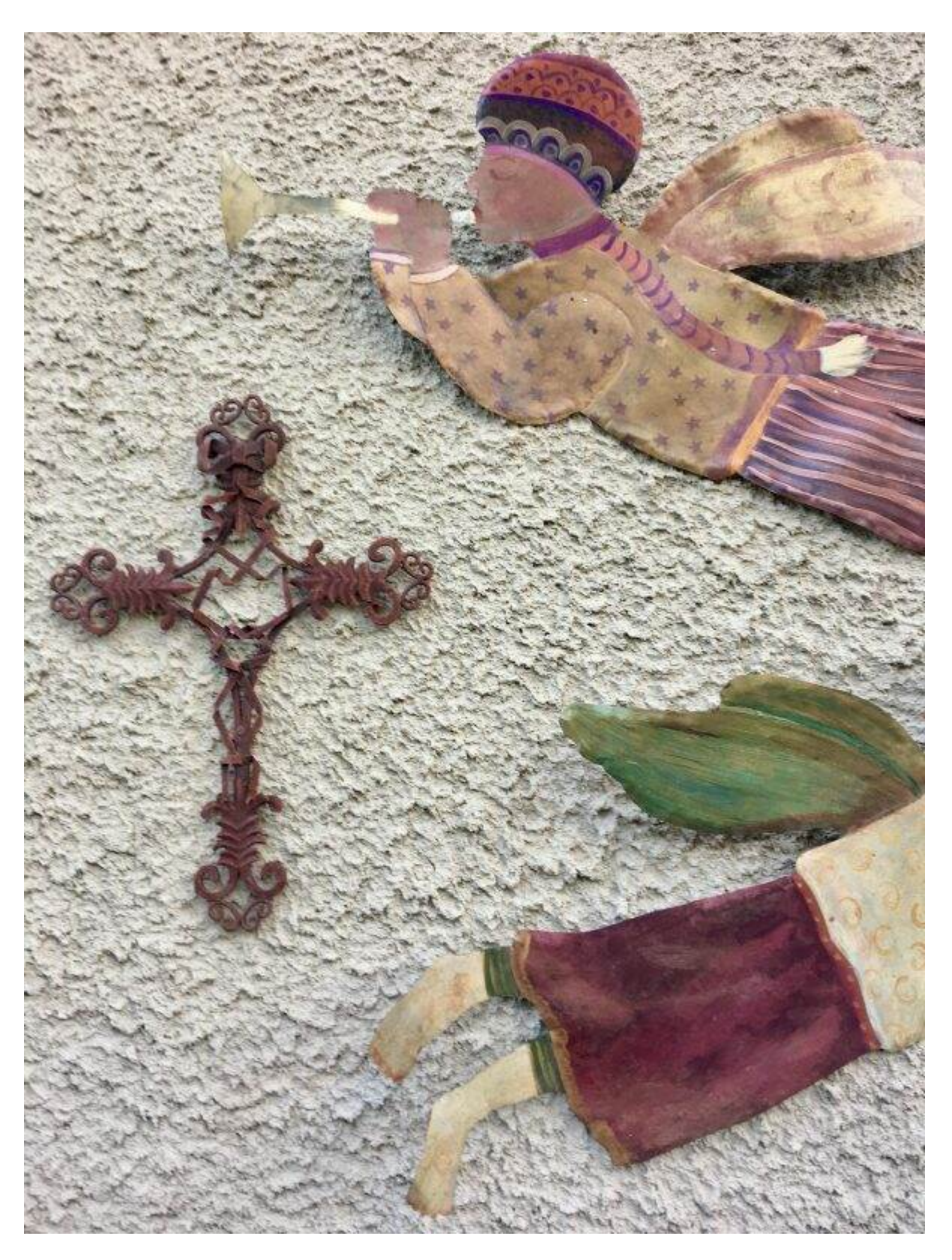
My goal for the rest of 2019 is to live purposefully and with

media or Pinterest. It's not easy to forget those holidays when I mourned the loss of loved ones or struggled with other personal pain. But when you have a good year, it should be celebrated.