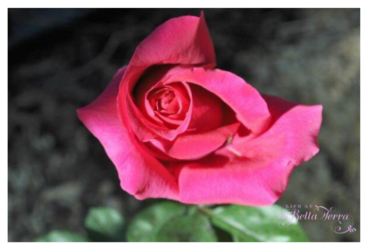
A rose in our garden

compliment with a smile, would be a better response. I don't want to perpetuate negative energy. Instead, I want to change it and be part of the solution. Those who are mean and angry need our prayers.