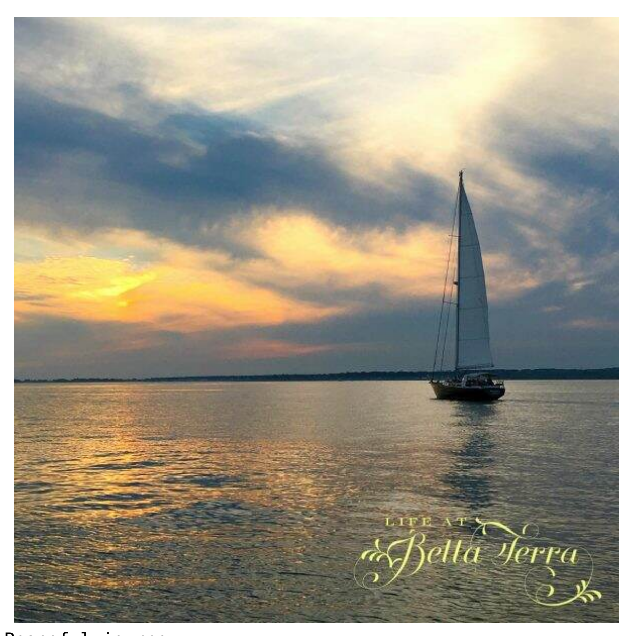
Peaceful journey Sending kind and loving thoughts your way.