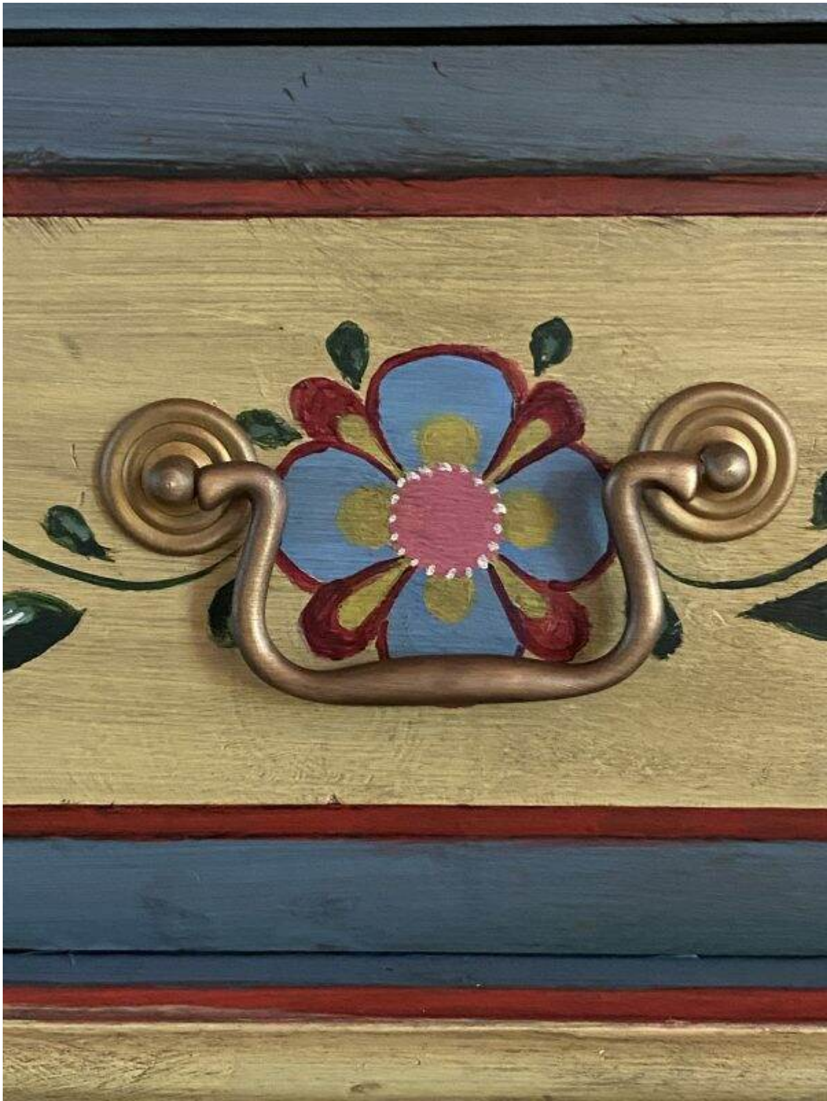
New pulls from Van Dyke's Restorers