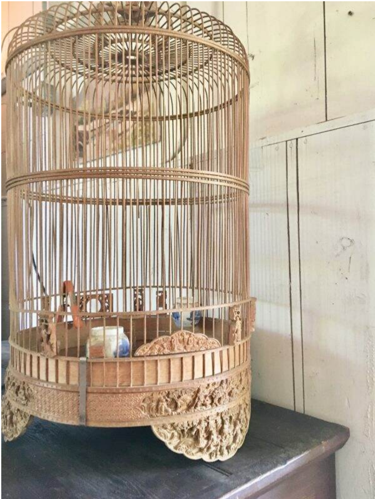
Beautifully carved bird cage with porcelain water/feed bowls Here is the barn, all fresh and clean.