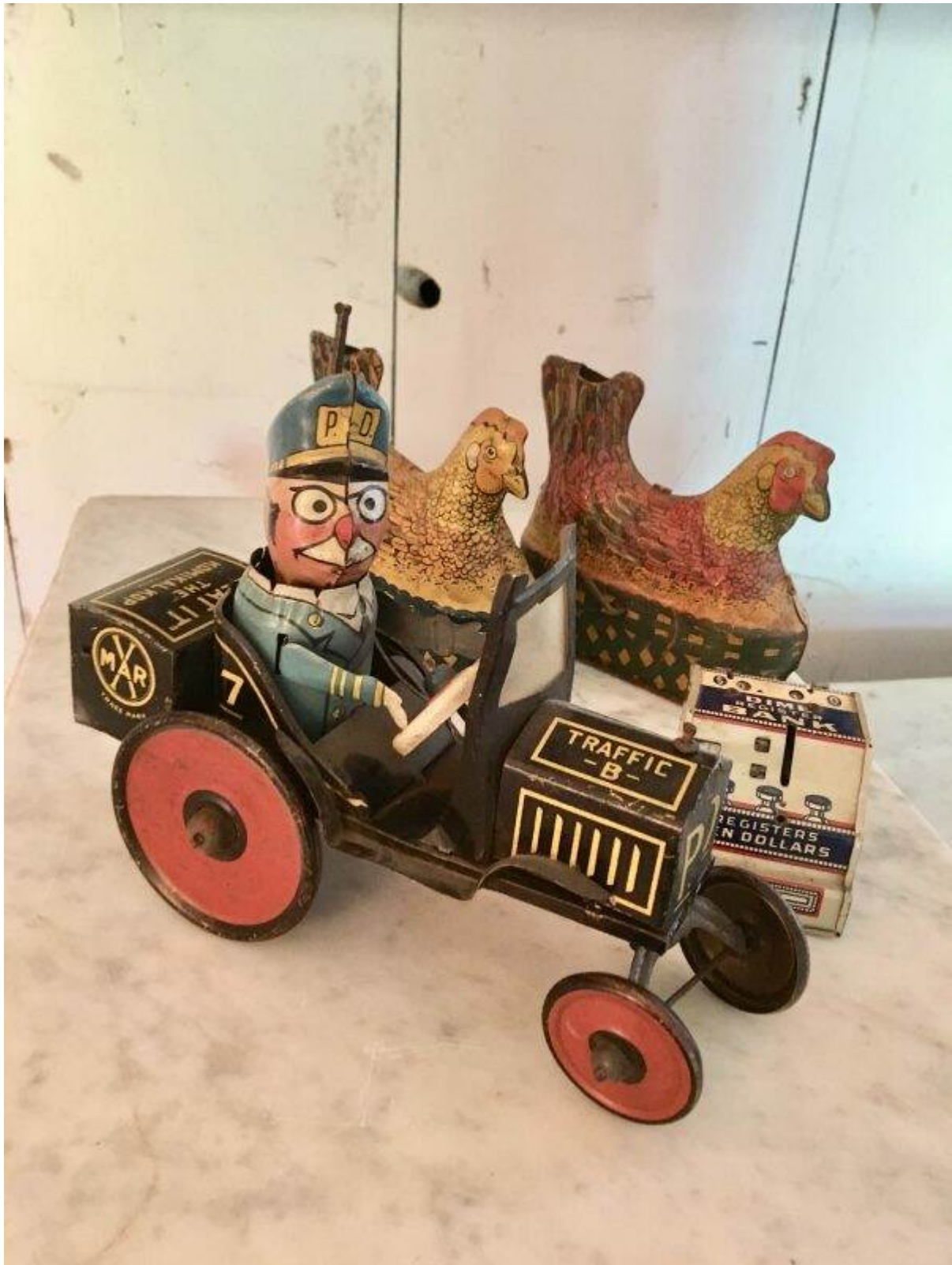
Old metal wind-up toys