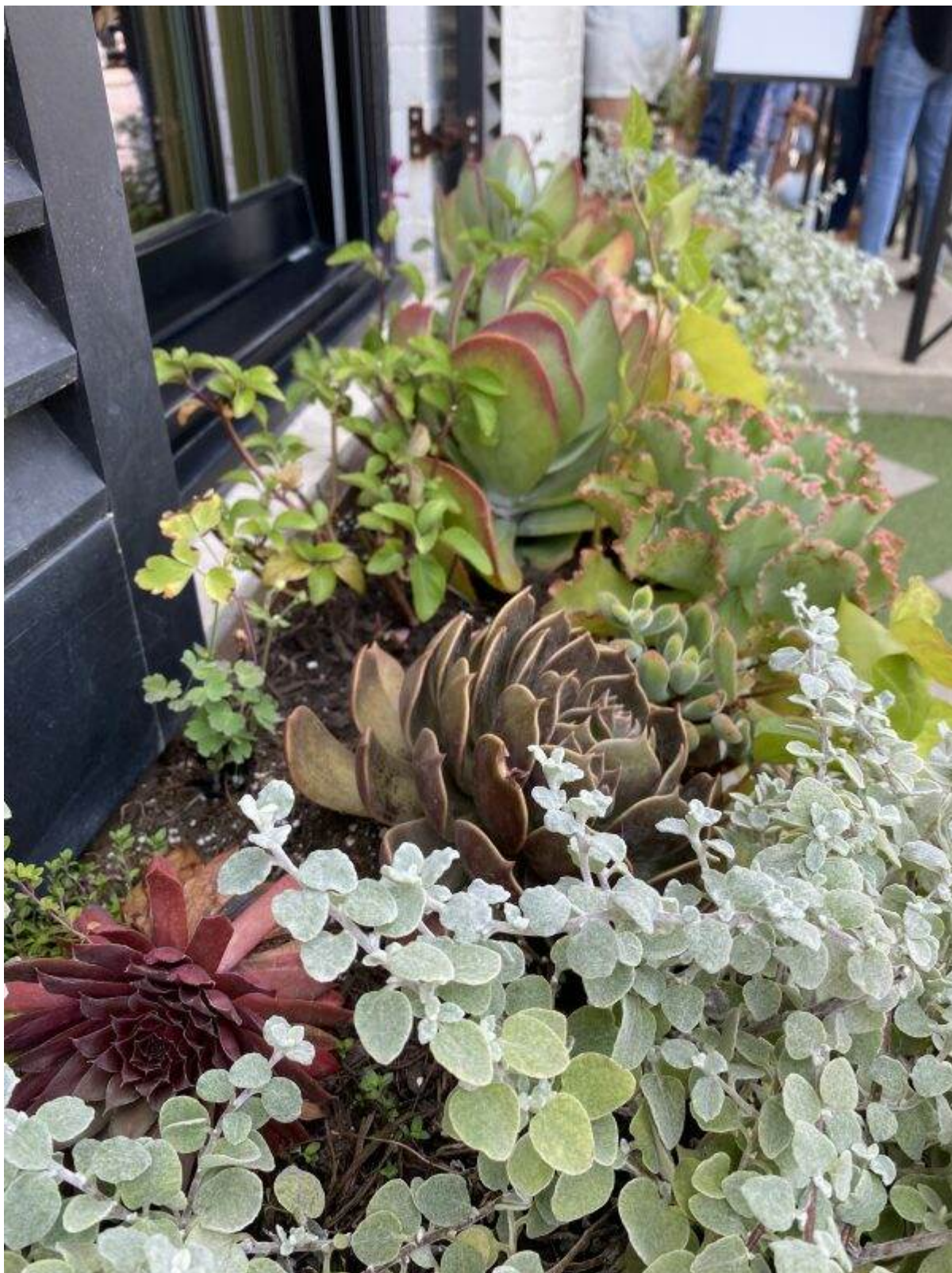
Magnolia Bake Shop

choices here. It is not my jam so the few things that were of interest, I can order online.