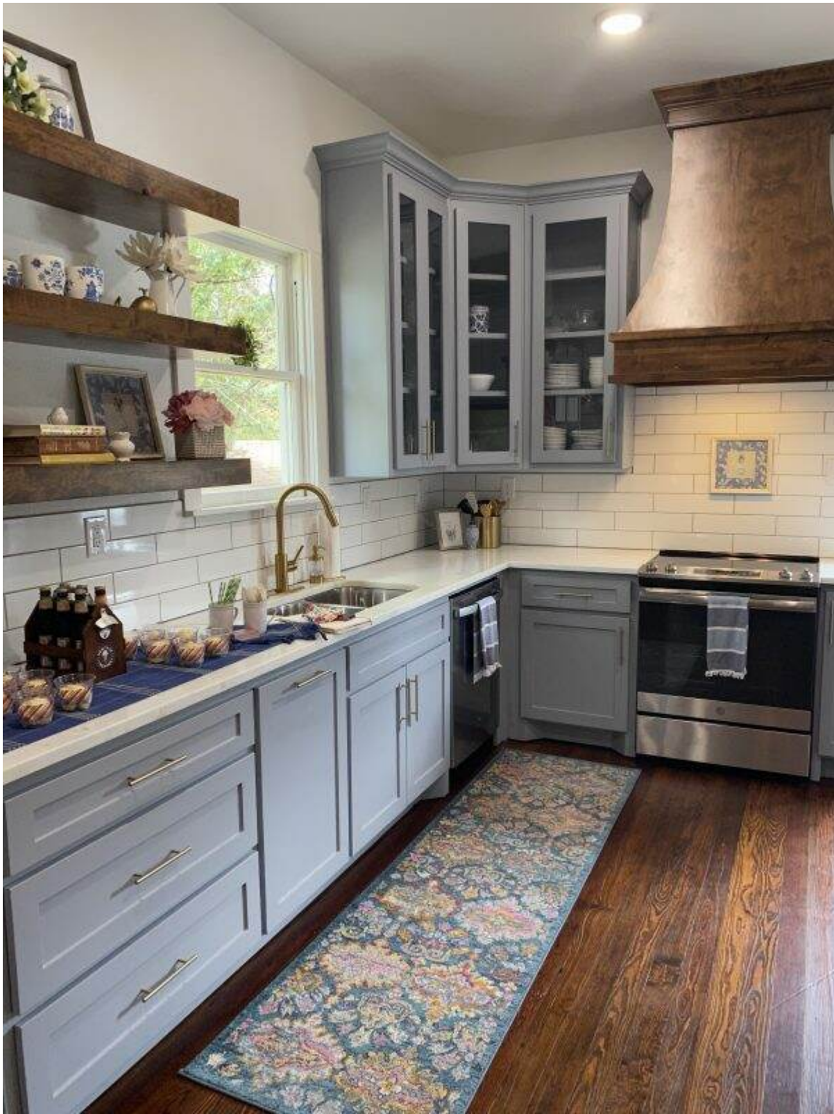
Beautiful Full Kitchen