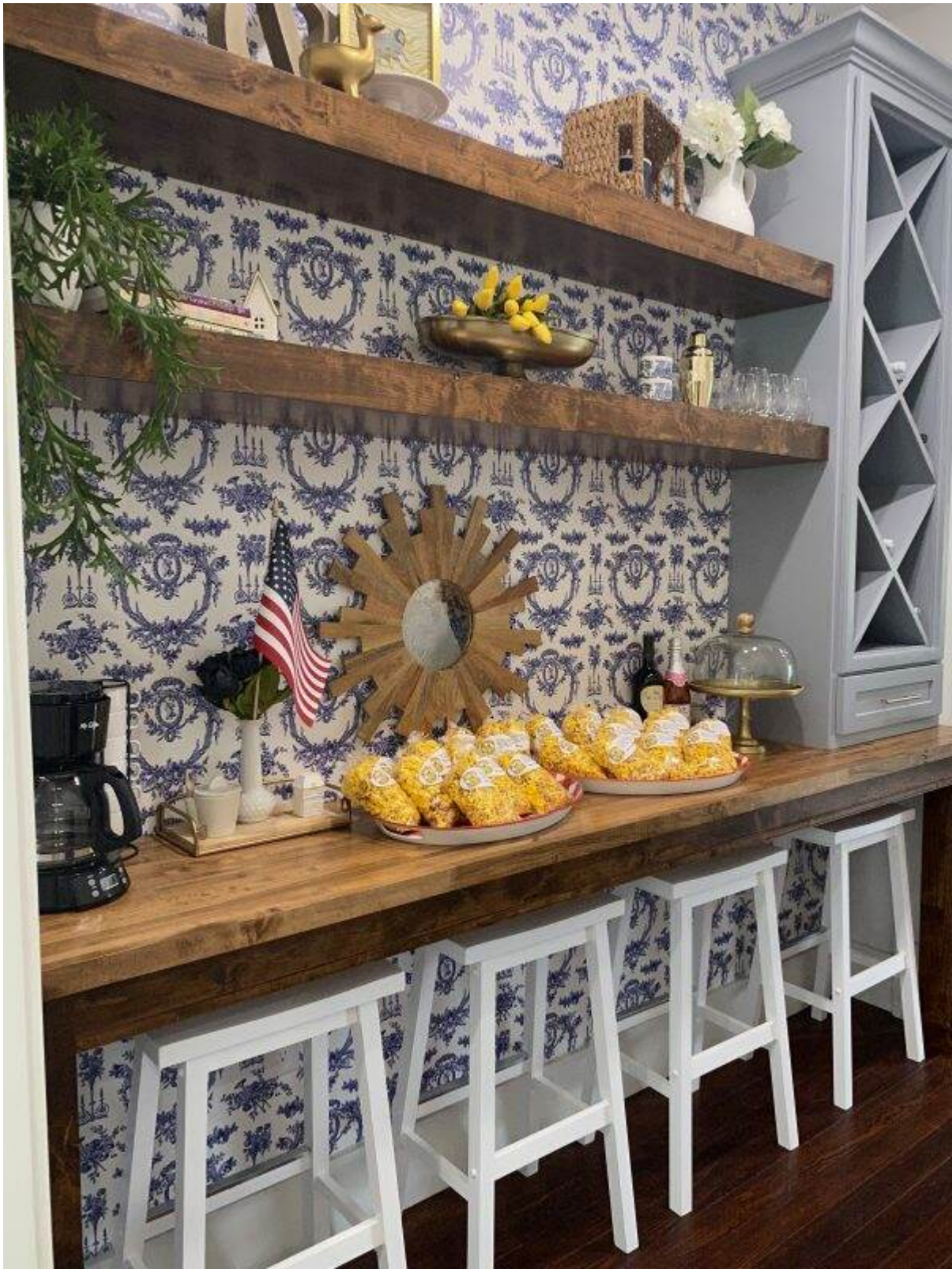
Popcorn treats provided by #offthecobpopcorn