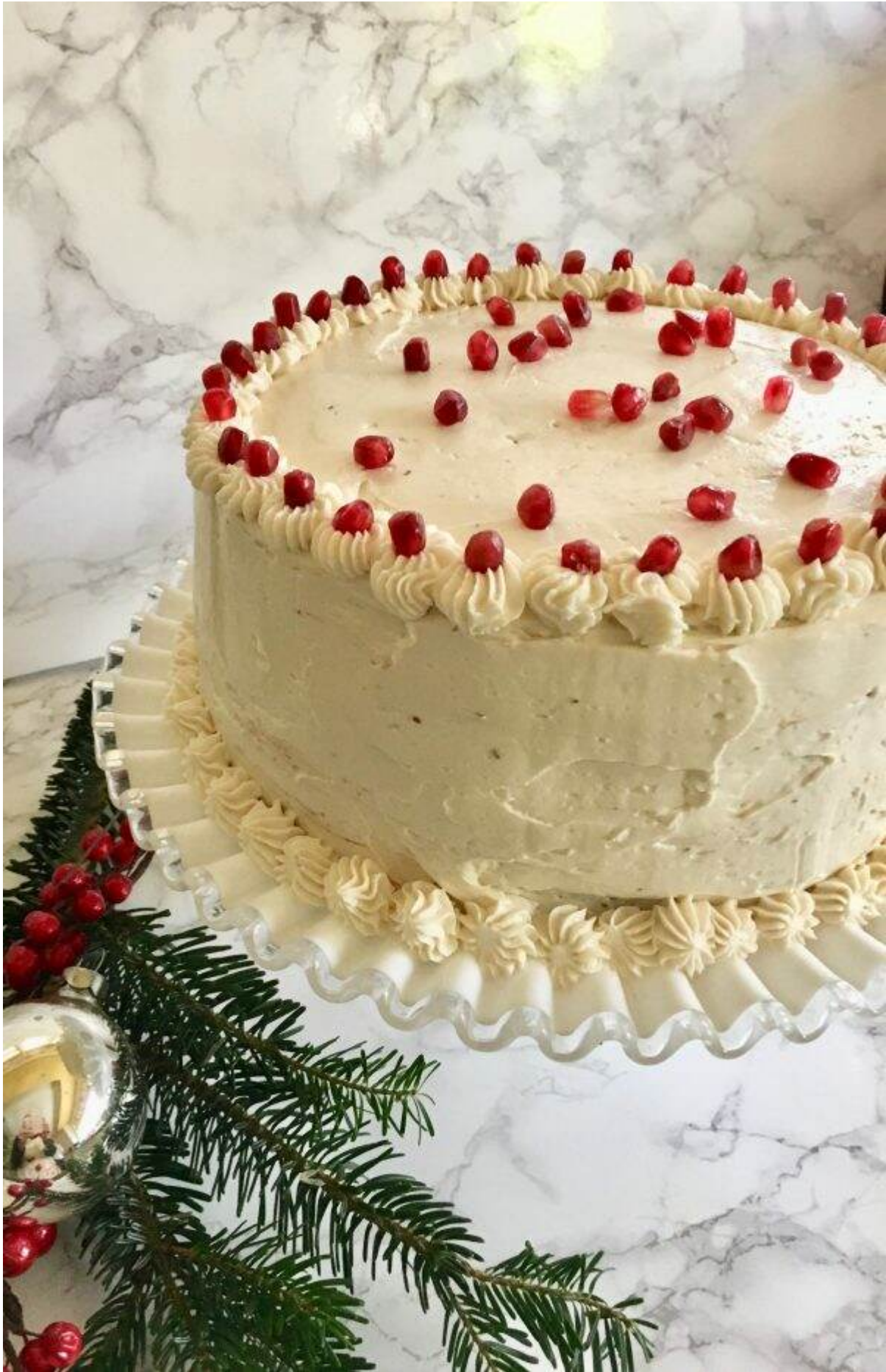
Chocolate Pomegranate Cake