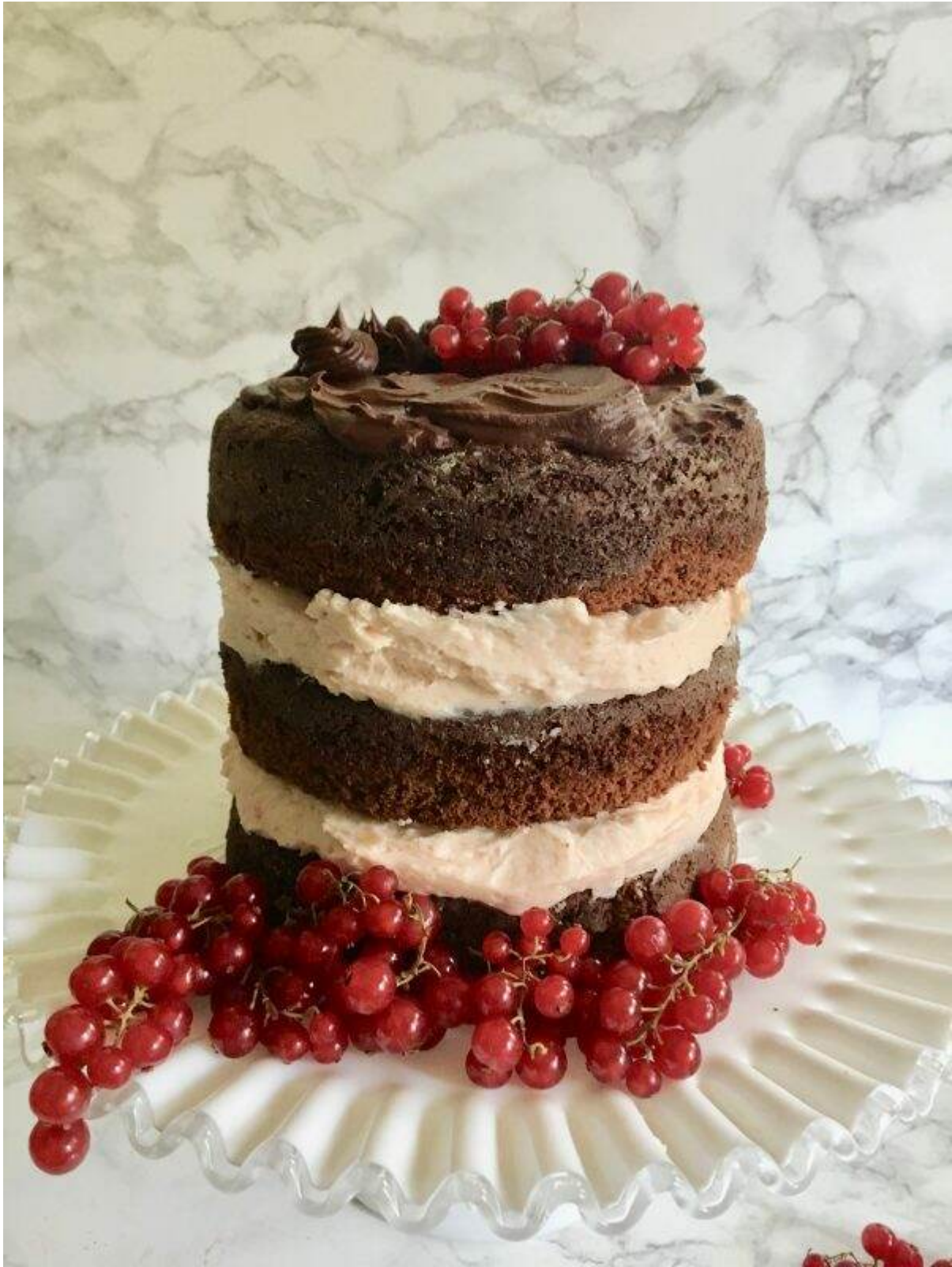
Red Currant Chocolate Cake