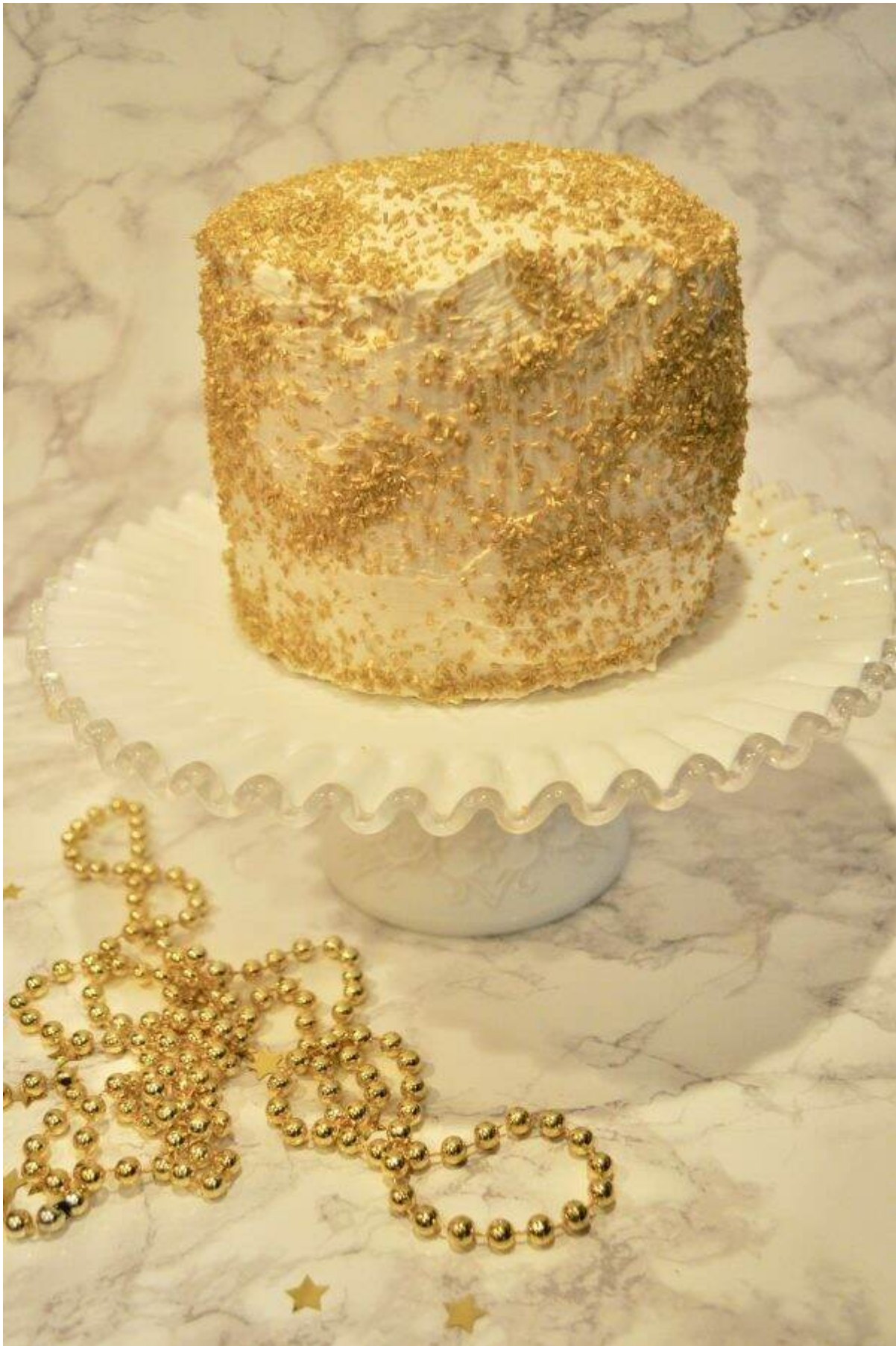
Golden Champagne Celebration Cake

And of course, what is Thanksgiving without pie! Homemade apple and Dad's famous pumpkin pies are always a big hit!