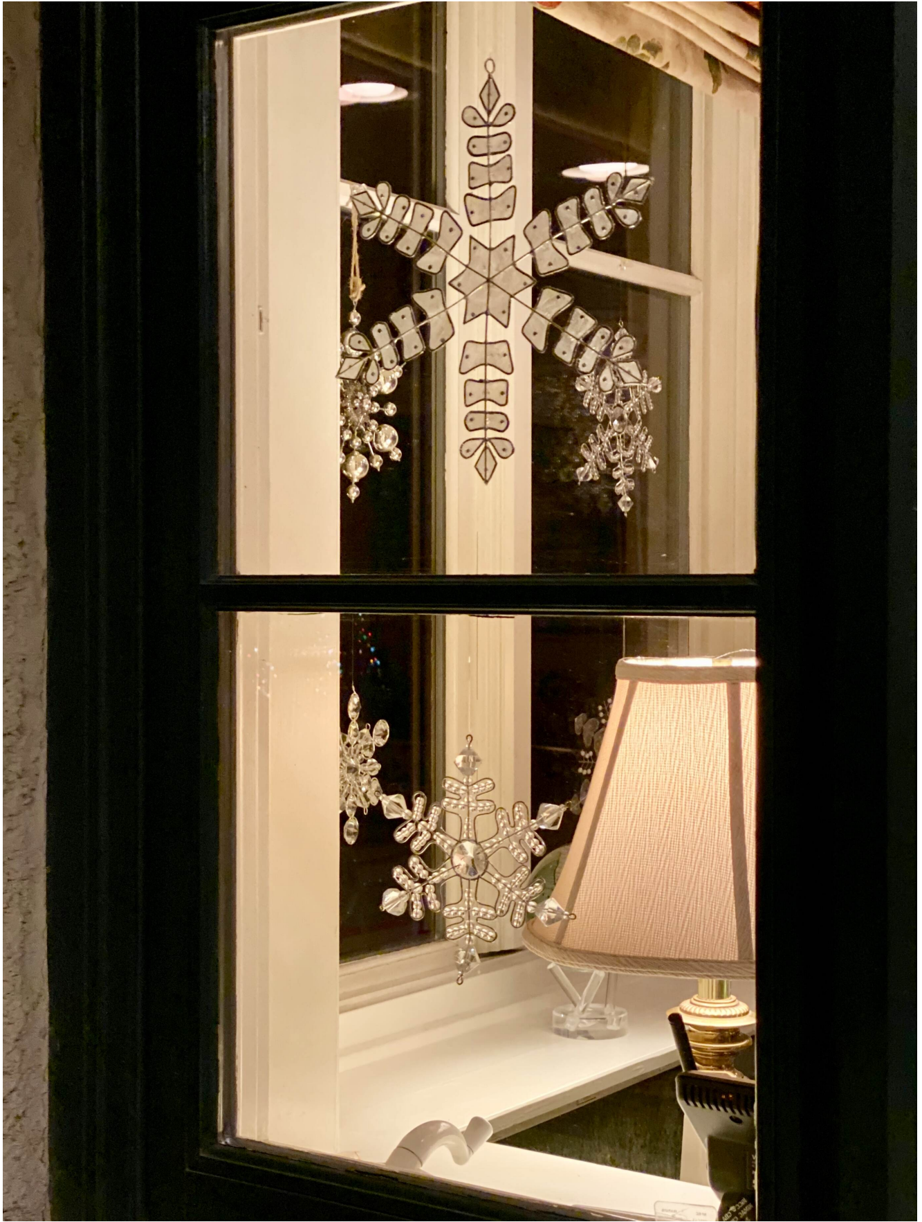
A holiday favorite.