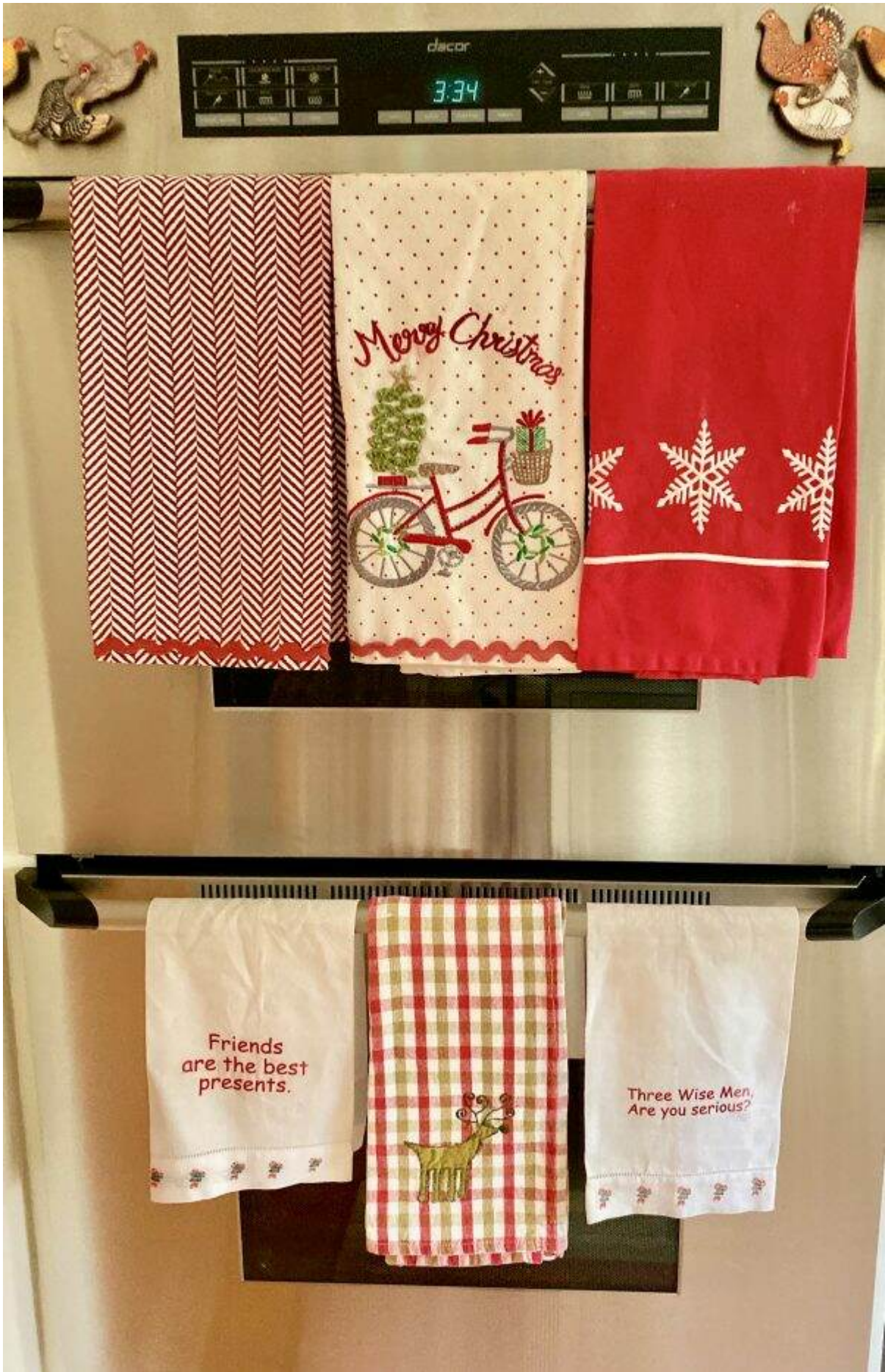
Pinecones, red berries and greens adorn the breakfast room