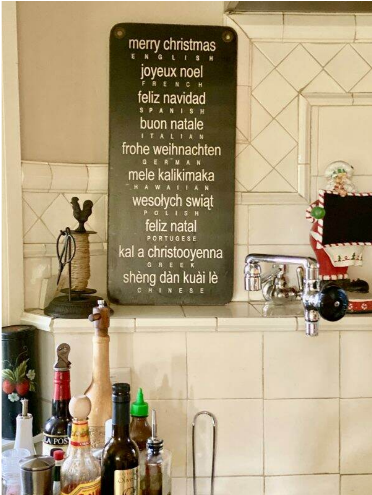
Our well-used coffee station was jollied up a bit with holiday themed mugs, napkins and faux berries.