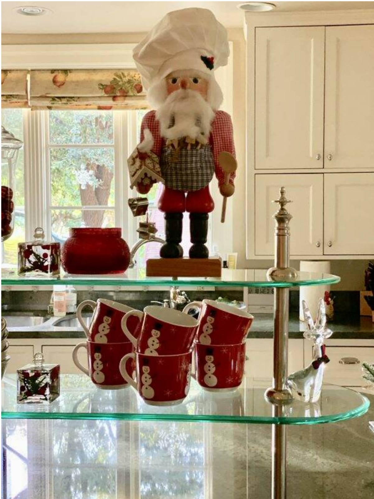
The kitchen themed Christmas tree has fruits, vegetables, pots and pans as ornaments.