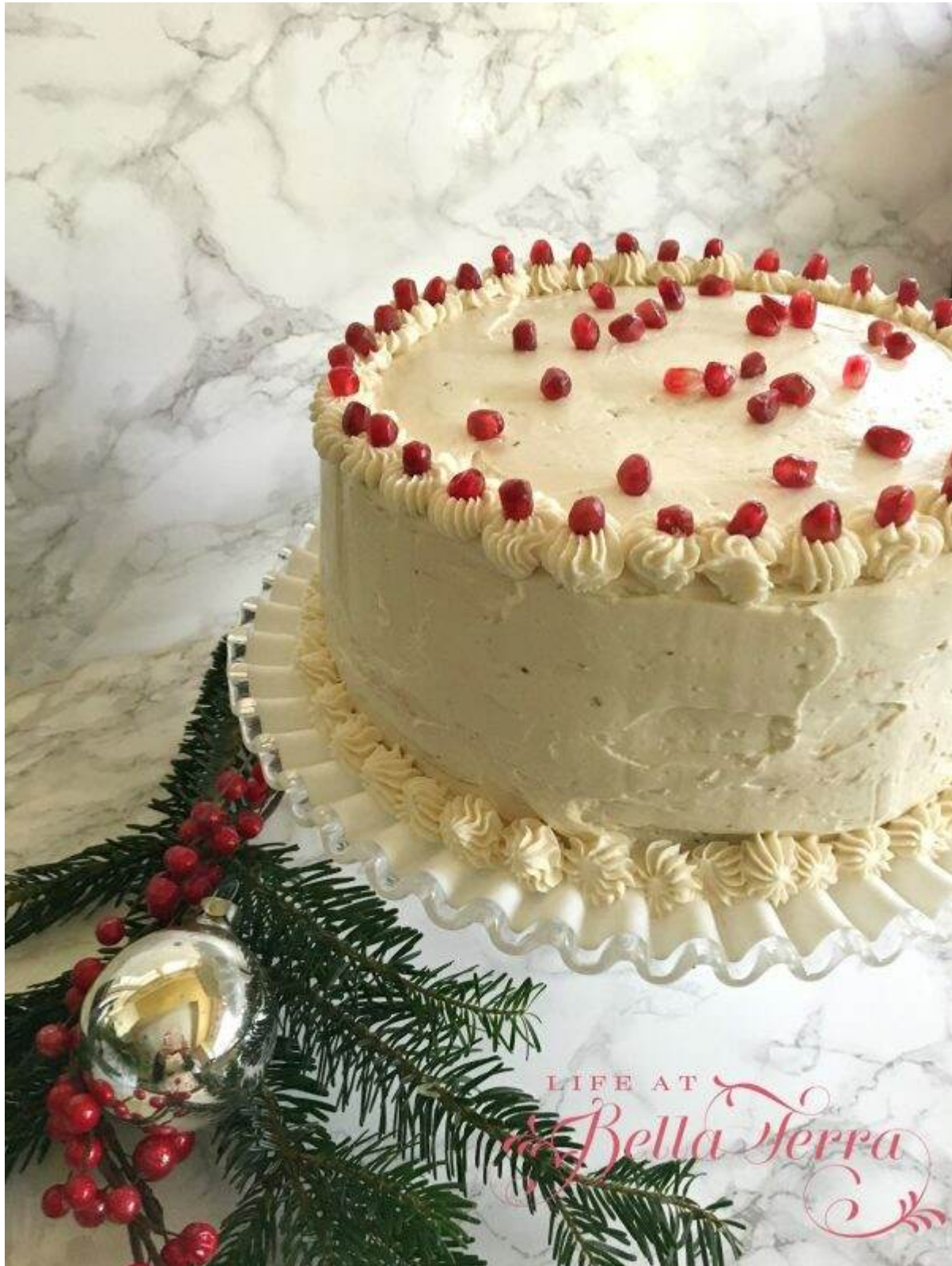
New Years 2016 was the Golden Champagne Celebration Cake.