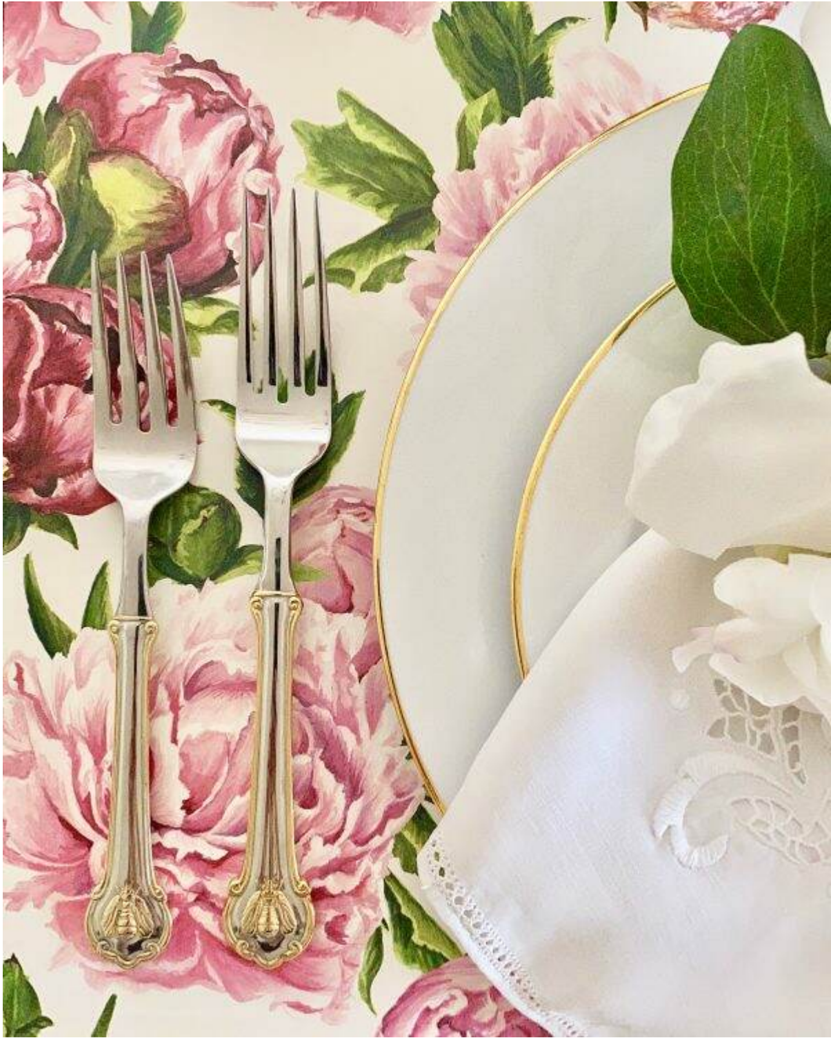
The peony place cards fold and stand by themselves.