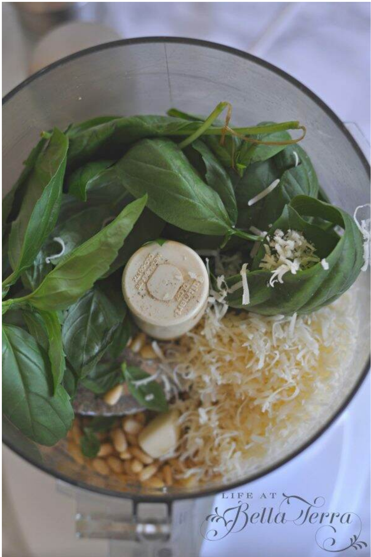
While the food processor is running, slowly add the oil.