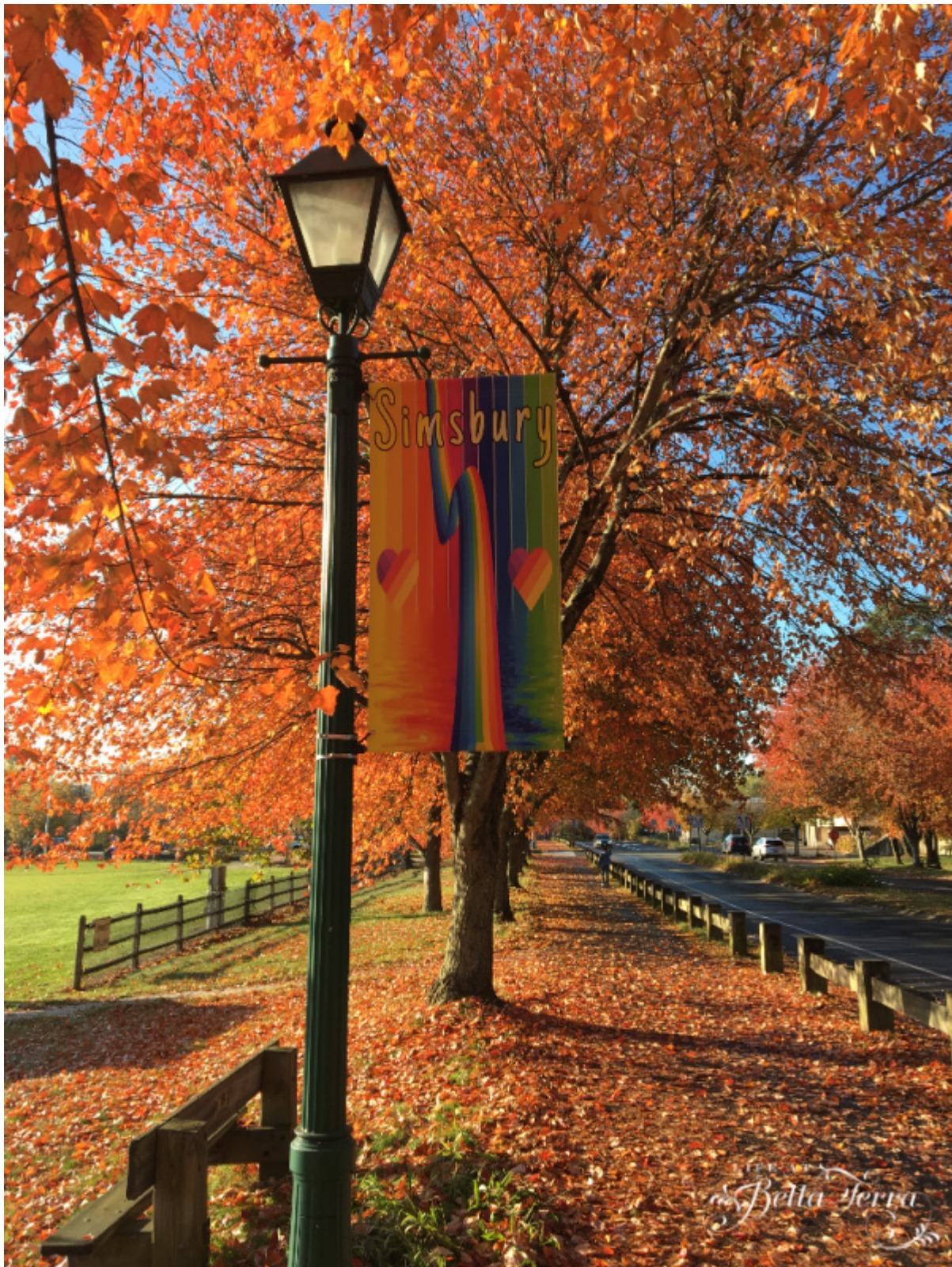
Simsbury, CT in the fall of 2019

My third (and last) child is a junior in college and I suddenly realized that I have never sent her a care package (bad mother feelings). So I quickly called Ava Grace and within an hour, they pulled together fun items for her and shipped it out that same day.