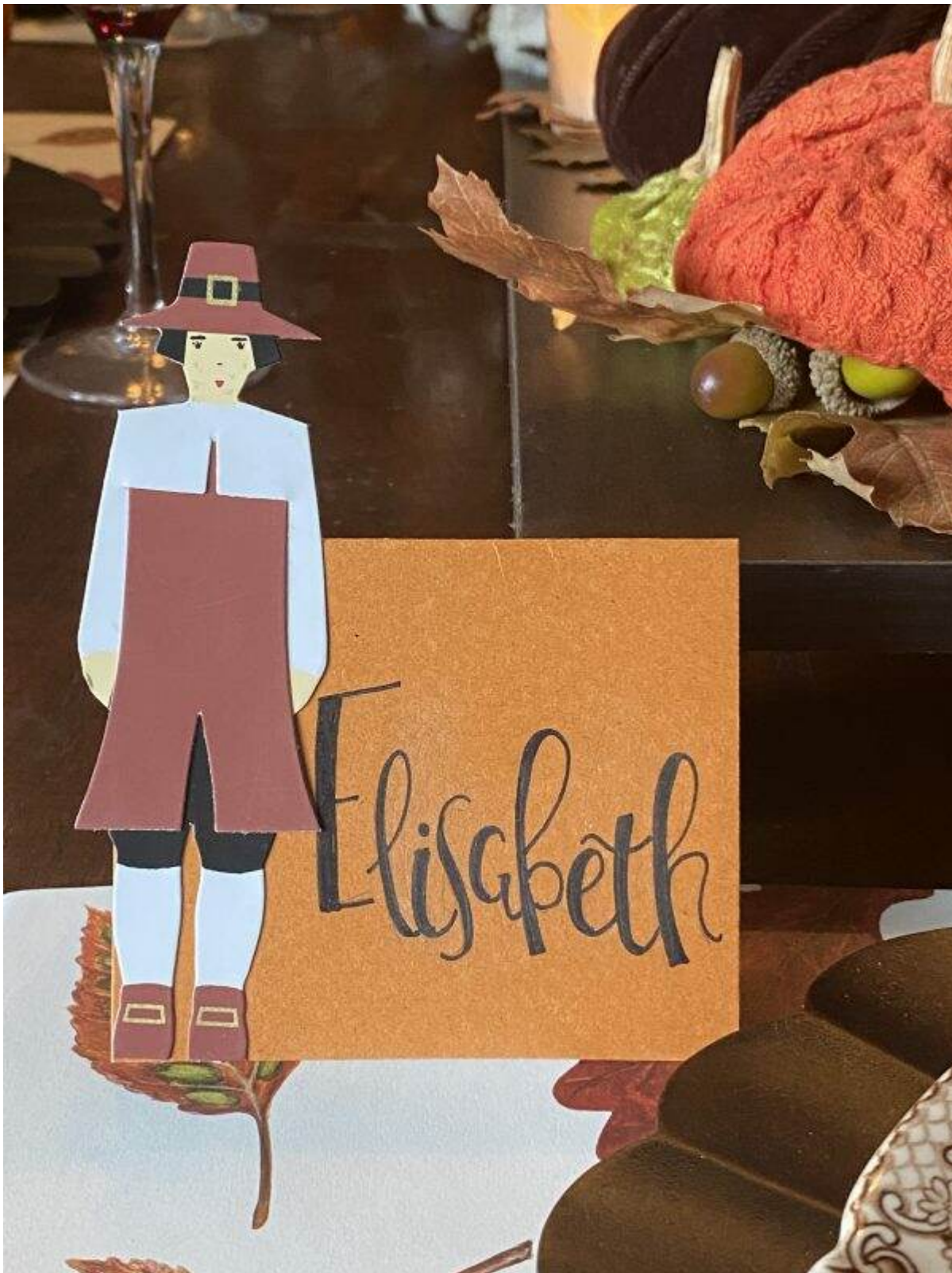
Calligraphy place cards

was 71 degrees and we decided to set up the table outside on the back terrace. We've never eaten our holiday meal there, so it was very pleasant and gave us the space we needed.