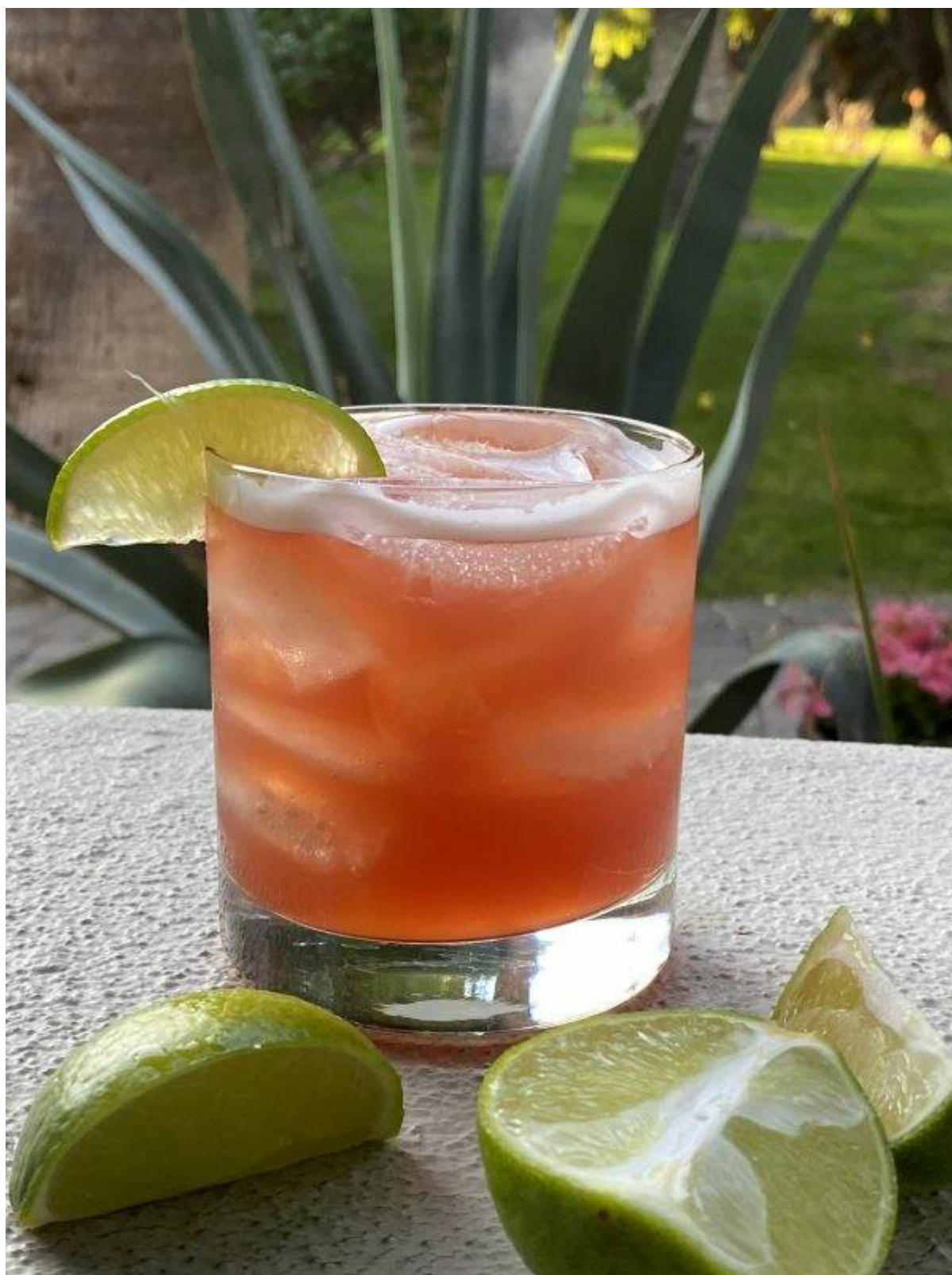
Jungle Bird Cocktail

I love this picture so much that I thought I would share this