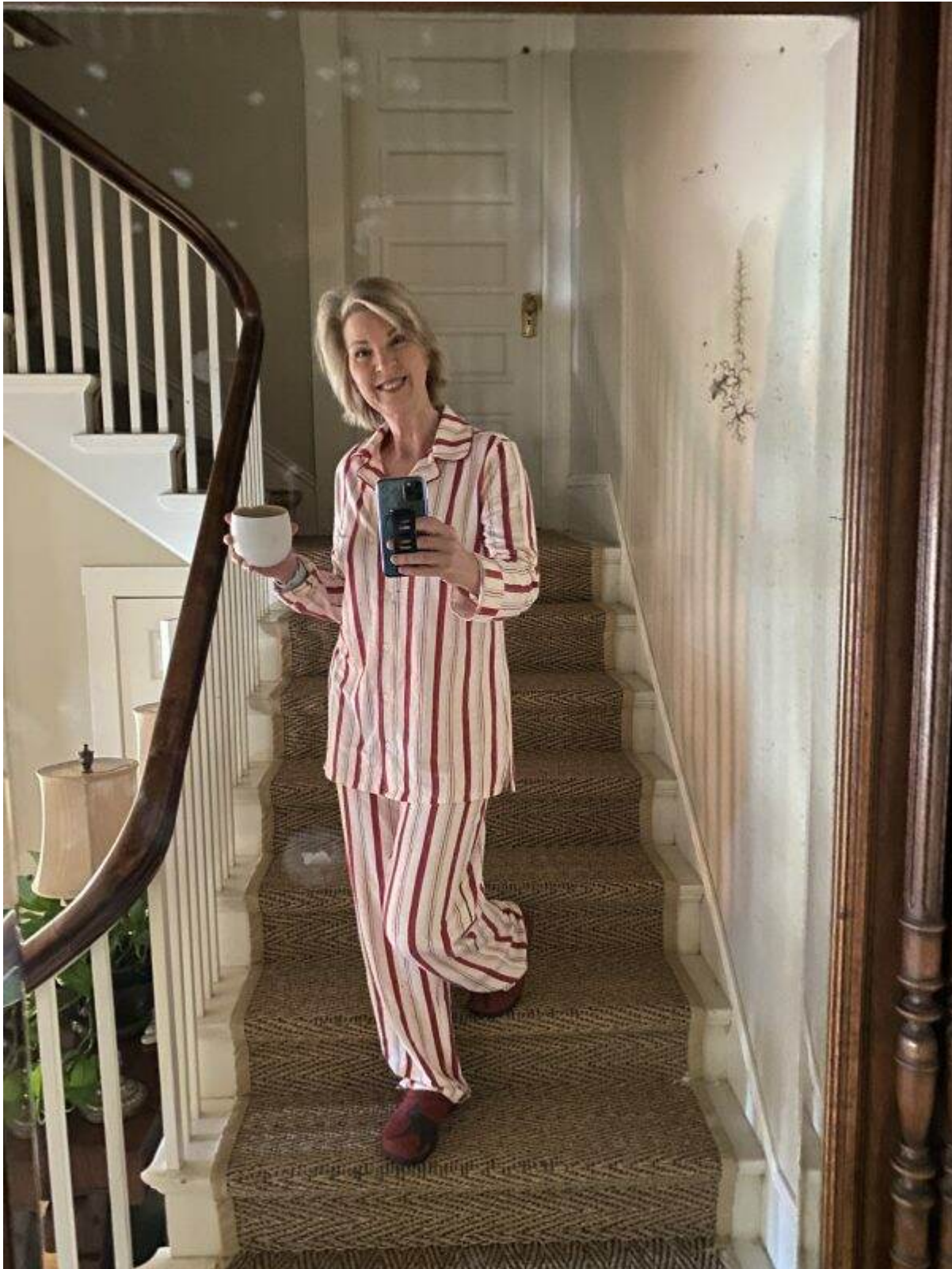
Striped pajamas from Soma

As you well know, Christmas holiday decor and celebrations do not start here at Bella Terra until after Thanksgiving. In order to welcome in the new season, I just bought these fun red/white striped pajamas from Soma. The pants have pockets and a drawstring waist~so very comfortable. Even though these