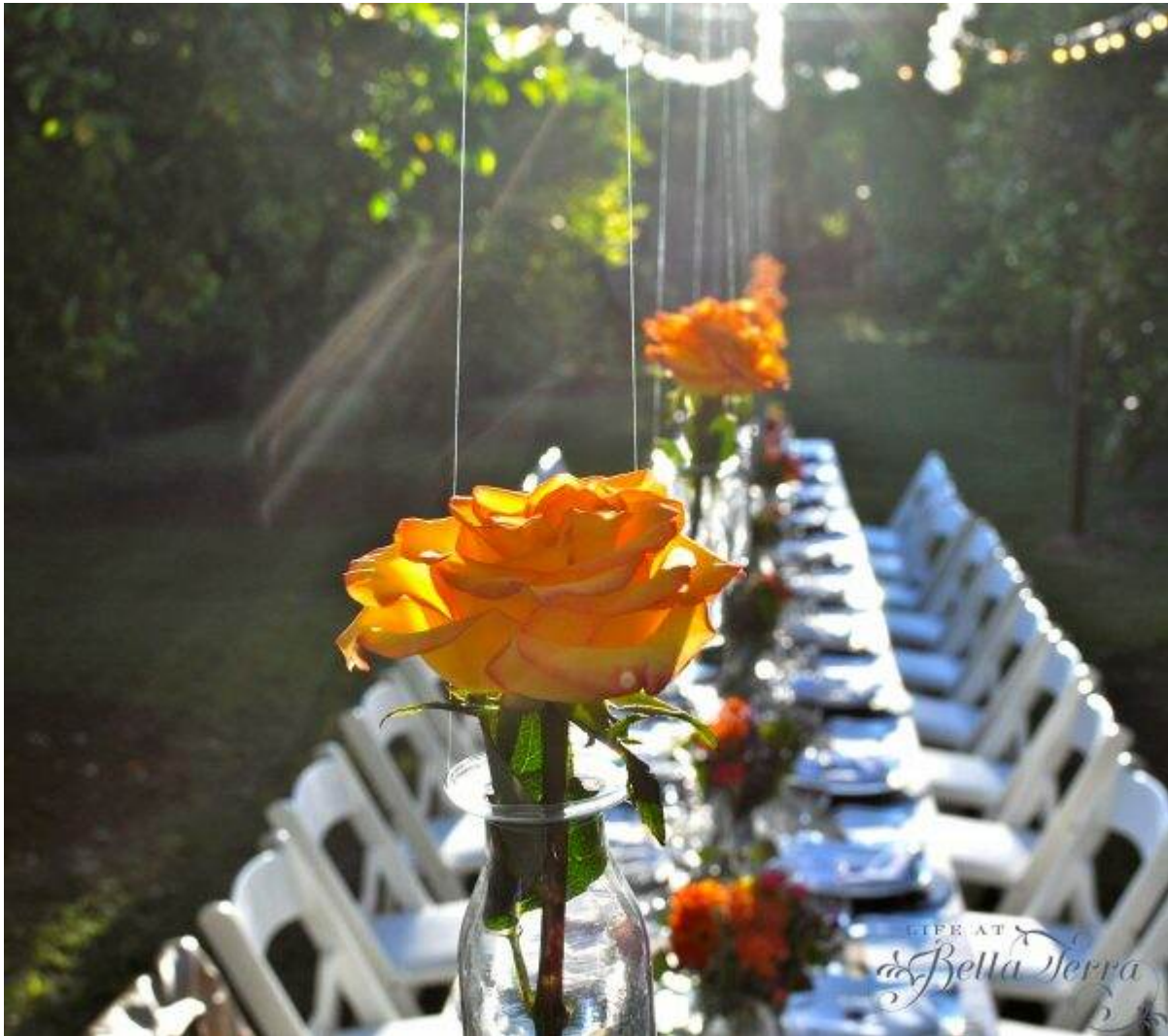
Hanging vials with roses