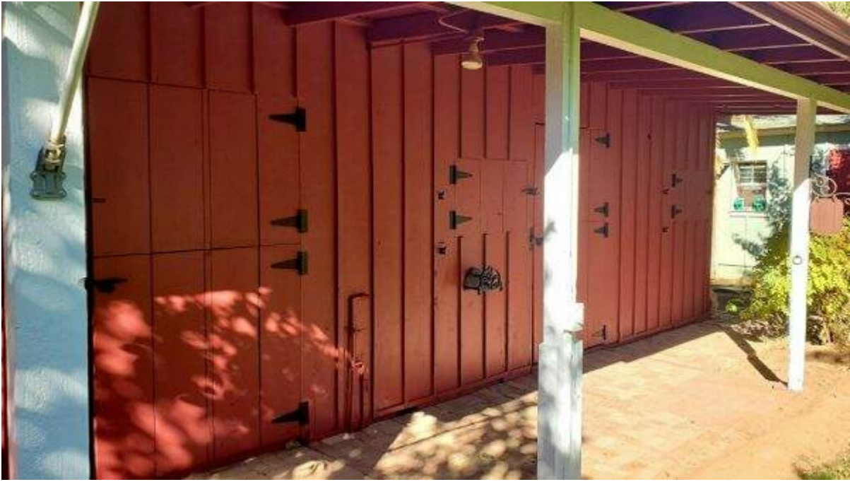
The Hen House