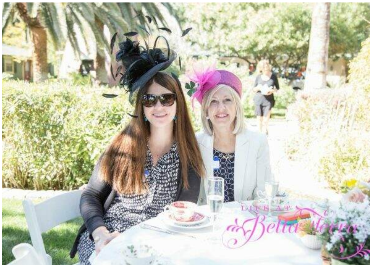
Even a vintage 1920s dress, hat and shoes!