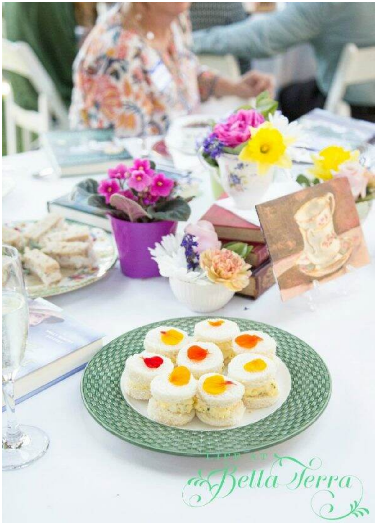
And GORGEOUS desserts.