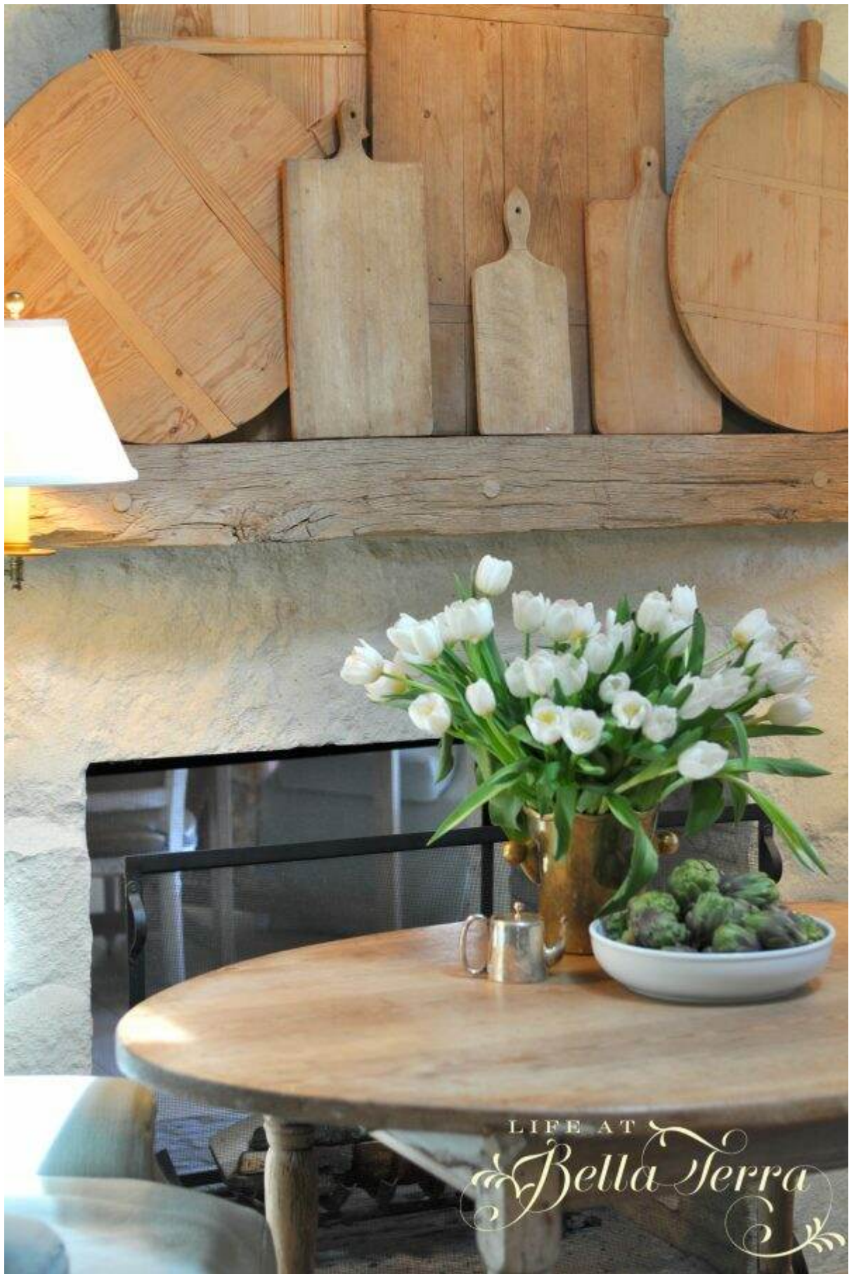
Fresh flowers were in every room.