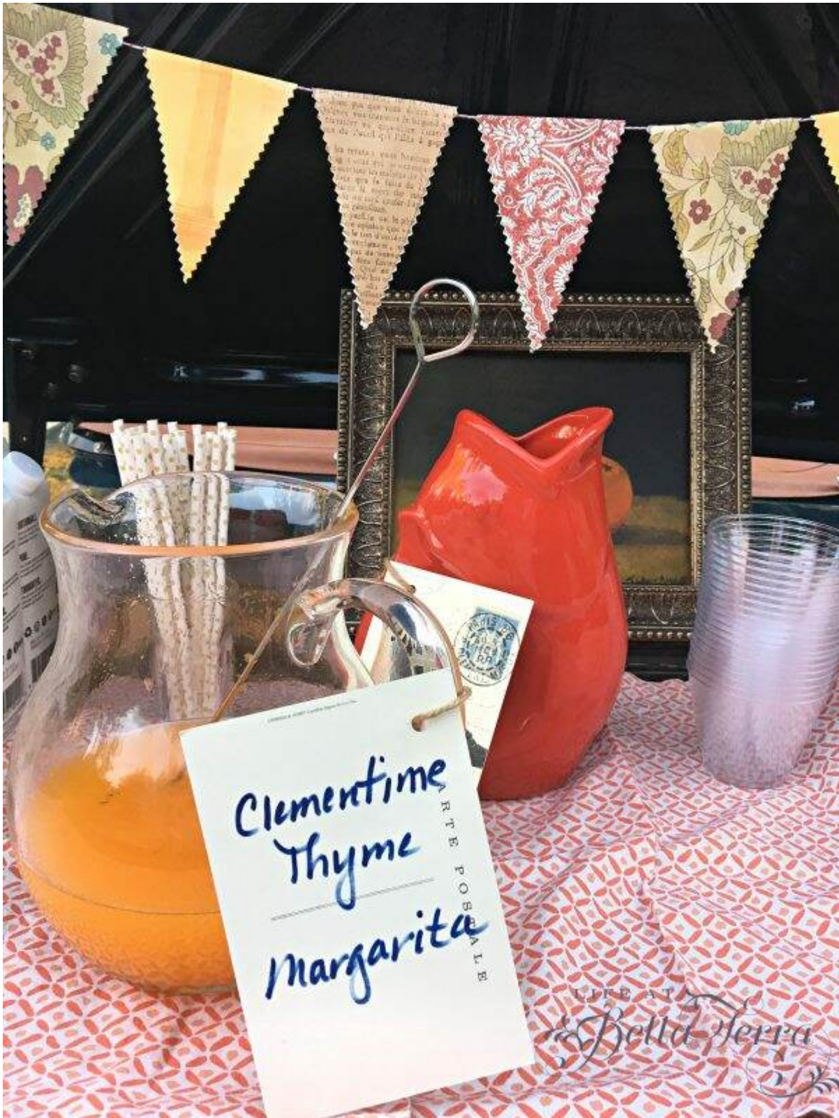
The Gurgling Red pitcher was a gift from my son's girlfriend. The porch and front entrance were colorfully appointed for the season.