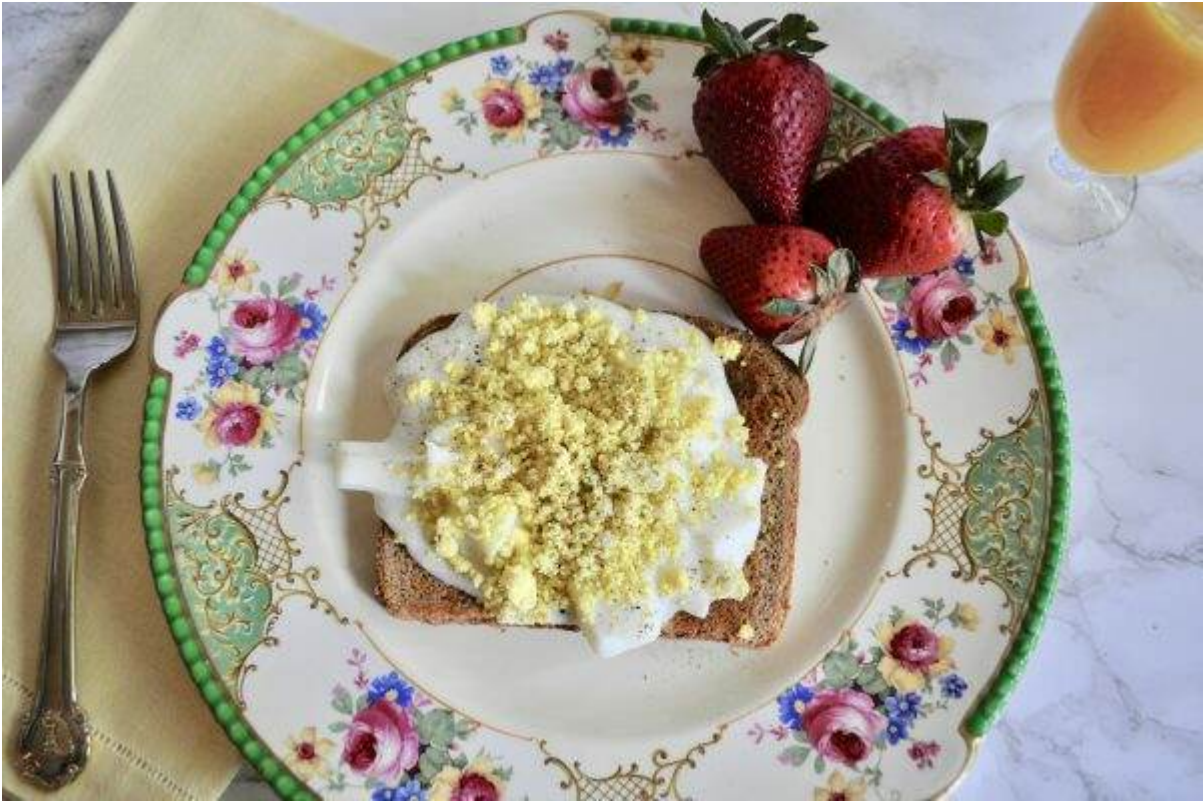
Benjamin made mimosas with fresh squeezed orange juice and Prosecco.