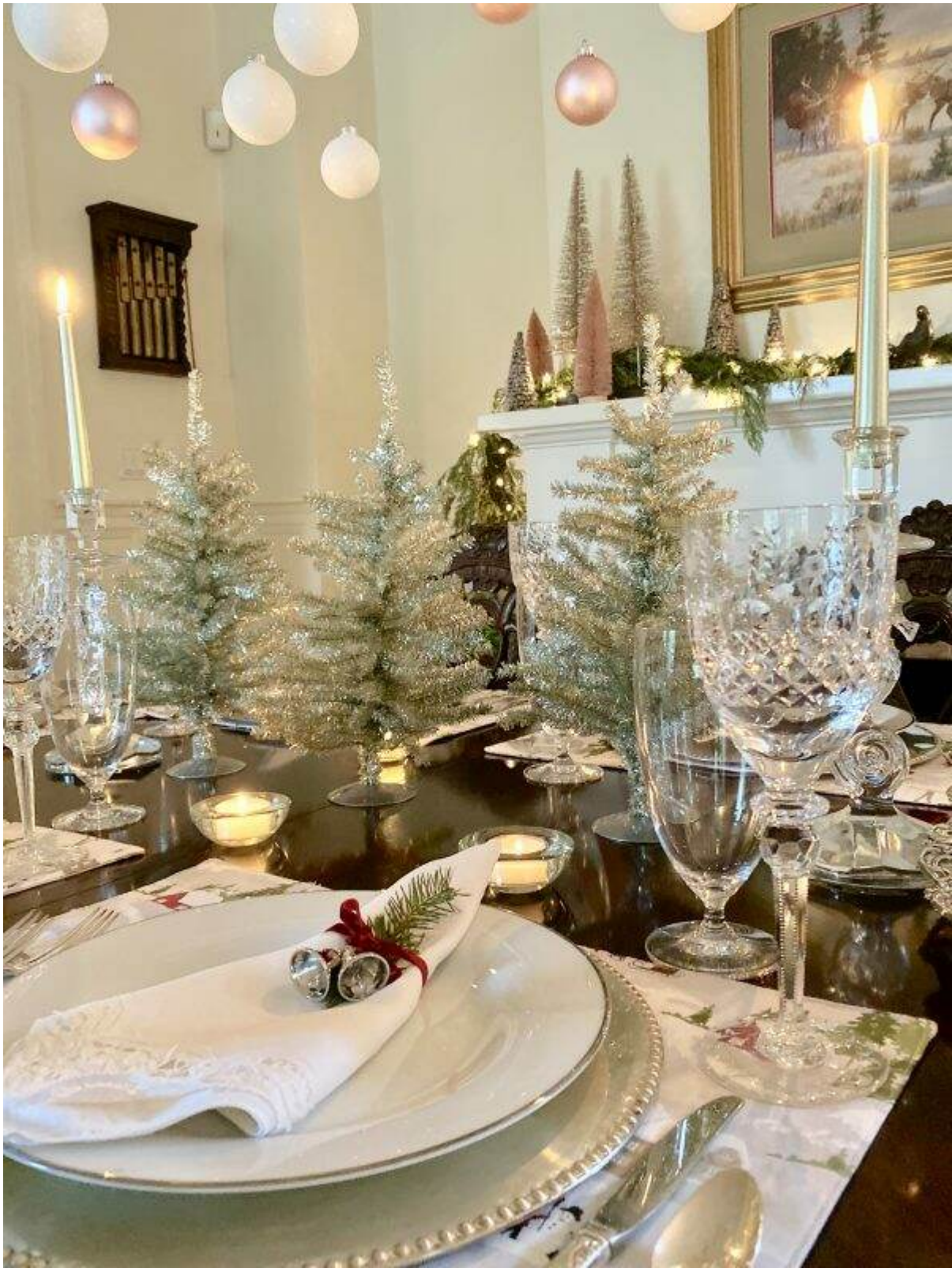
The 3 silvery trees came from Whitfill Nursery