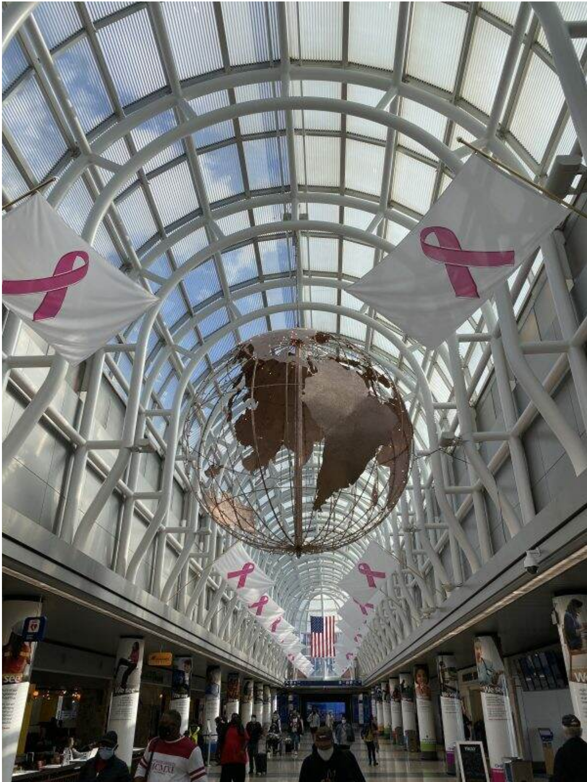
Love this concourse at O'Hara airport

day was overcast and must be a drop in barometric pressure, as I didn't feel like doing anything! So I apologize for not posting last Saturday and look forward to catching up today!