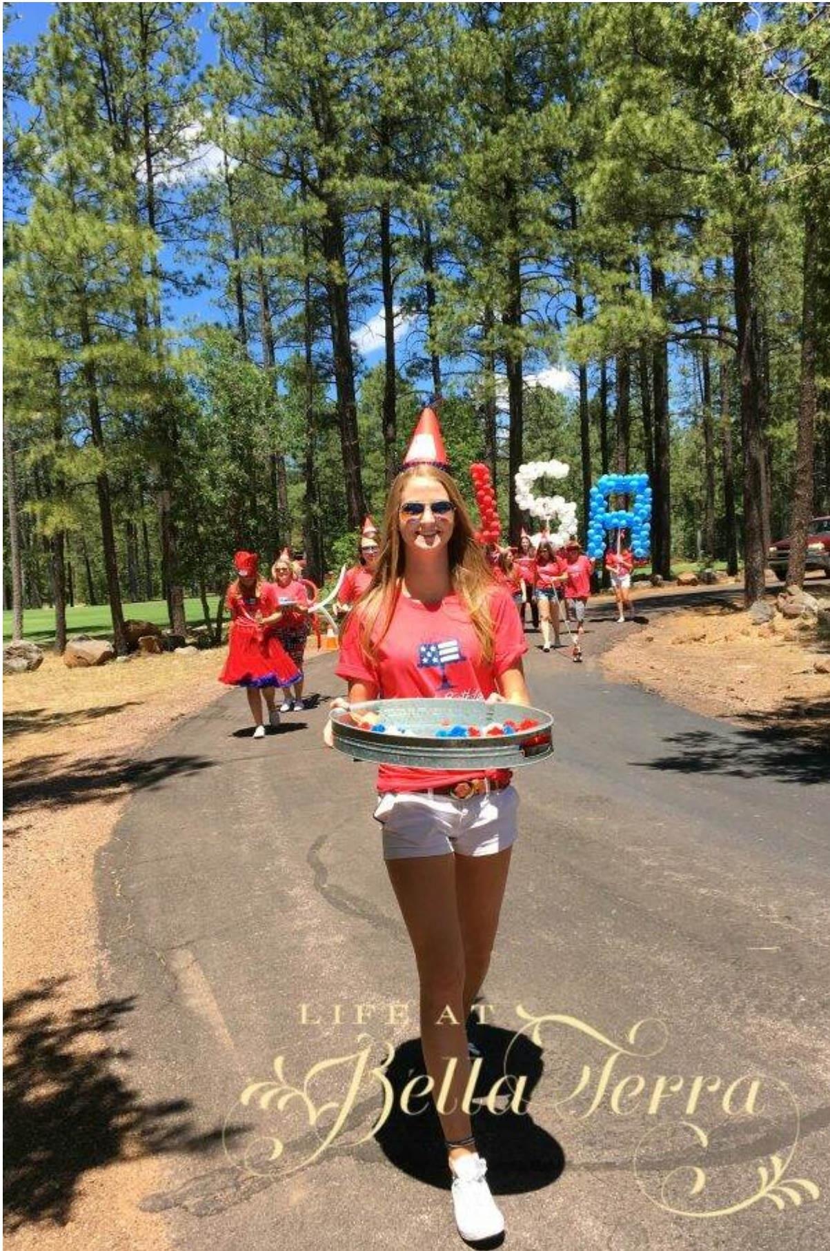
What a fun play on Red Cups!